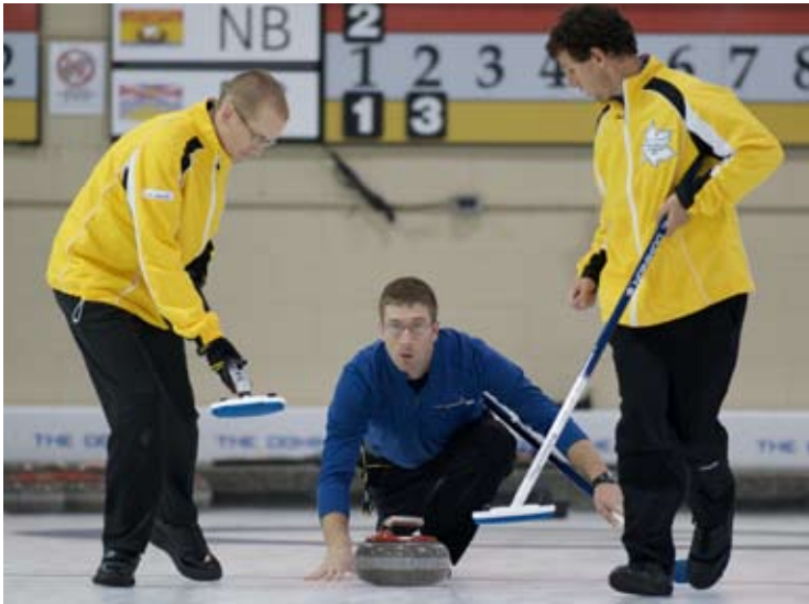
Our New Brunswick men closed out a week of good curling yesterday...