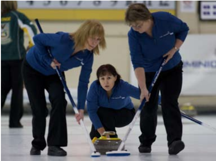
... as did our women from the Northwest Territories.