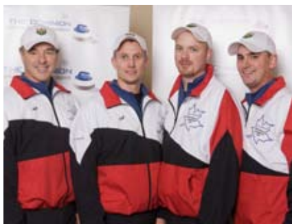
Two of these teams will win the Men's Semi-Finals and duel for the national championship.