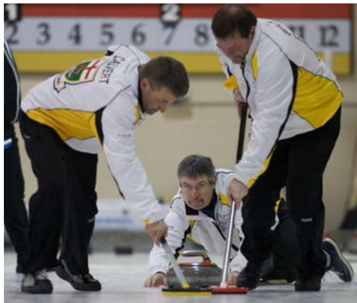
The Ontario women and Manitoba men were among six undefeated teams as The Dominion Curling Club Championship closed out its second day of draws.