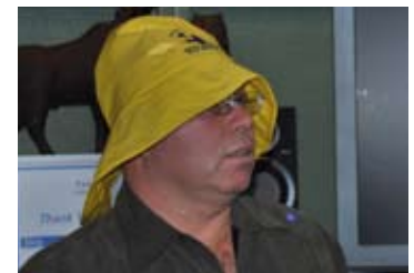
Nova Scotia has some dedicated fans in the crowd...