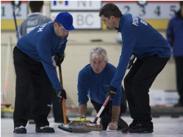
The British Columbia men won their first victory late in Day 2 over Alberta...