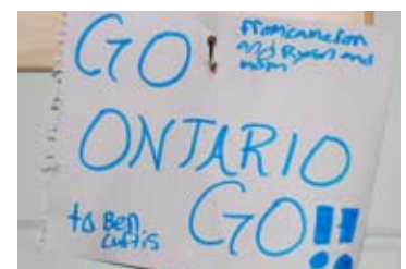
... while Ontario is also receiving its share of enthusiastic support!