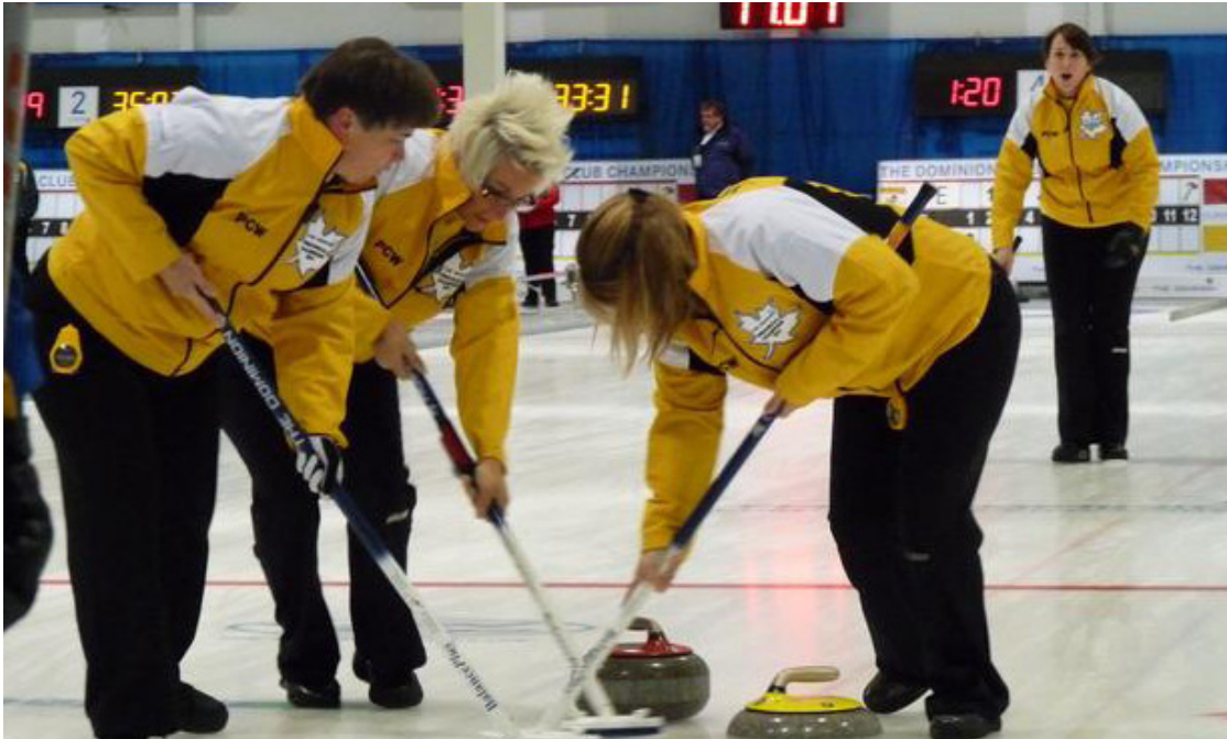
The Nova Scotia women's team swept their way to victory during Draw 10

With just one game to go, the women's playoff picture is still up in the air for as many as seven teams. The "Grey" pool has three teams—Manitoba, Northern Ontario and Alberta—tied for first place with 4 and 1 records. Manitoba had the bye in Draw 12, while Northern Ontario beat The Yukon 11-1, and Alberta scored a 7-ender on their way to a 10-2 win over Northwest Territories. And don't forget New Brunswick—Shannon Tatlock of the Beausejour Curling Club beat B.C. 5-4 in a game that knocked