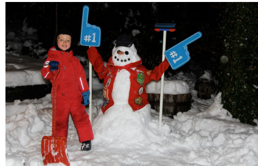
Family cheers for team NL from the snowy streets of Newfoundland